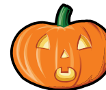
Oct 31 Happy Halloween