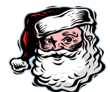
Dec 25 Merry Christmas